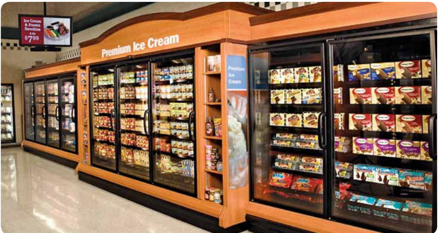
radiance Flat Laminates used in refrigerated retail fixtures