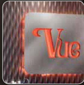
3 Dimensional Decorative Wall Surface