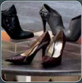
High Design Shelving