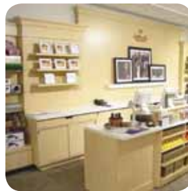
OMNOVA Paper Laminates used in retail fixtures